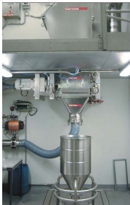
Sack tipping station for breaking up of granules; execution for CIP cleaning

Gericke GCN Cone Nibbler completes the range of products for applications requiring a very fine particle size, or if increased bulk density is required. Screen sizes range from 2000 to 150 \mu . Please request the appropriate documentation for this equipment.