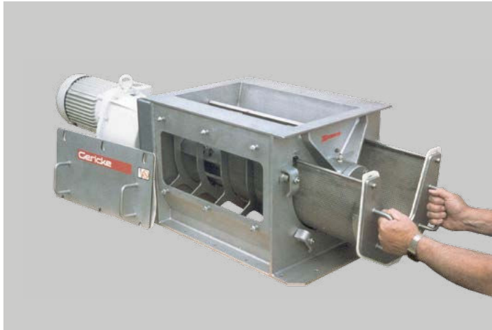
Nibbler model 300/450 with side cleaning door and screen