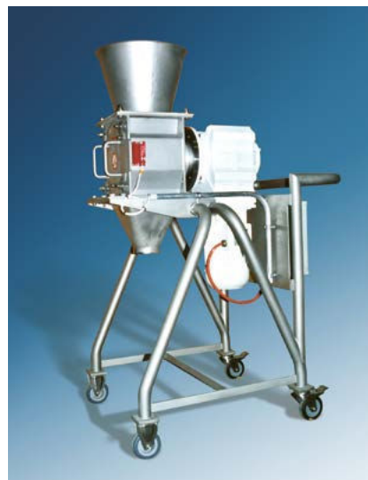
Picture left: Nibbler installed after filter press for breaking up filter cake