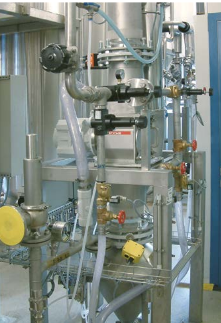
NBS 200/200 installed before pneumatic dense phase conveying