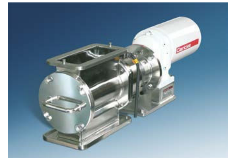
Pharmaceutical execution for exacting requirements, special requirements available