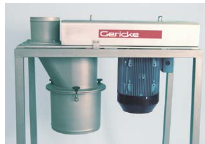
Cone Nibbler GCN

Gericke GCN Cone Nibbler completes the range of products for applications requiring a very fine particle size, or if increased bulk density is required. Screen sizes range from 2000 to 150 \mu . Please request the appropriate documentation for this equipment.